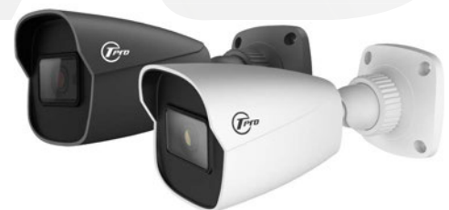
CAM HD MFL 5 G