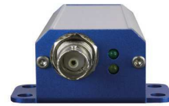
HIGHWIRE Longstar Coax and status LEDs

HIGHWIRE Longstar units must be used in pairs and, due to the special technology used for very long-range performance, are not compatible with the rest of Veracity's HIGHWIRE and HIGHWIRE Powerstar product range.